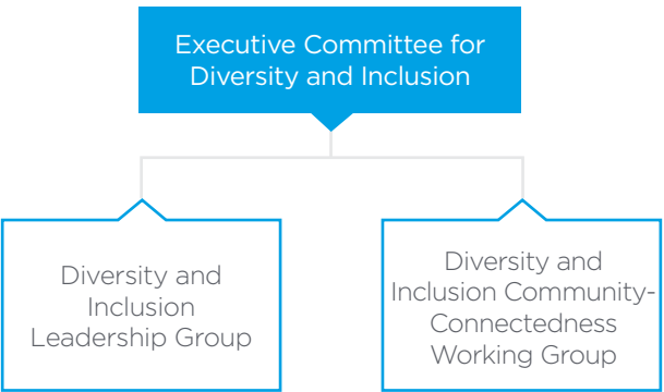
Figure 2: Governance

The Emergency Management Commissioner will establish an Executive Committee on Diversity and Inclusion to oversee the development and implementation of an initial, sector-wide, three-year strategic plan on diversity and inclusion to achieve the outcomes outlined in this Framework. This plan will complement and expand on the activities undertaken under the SAP.